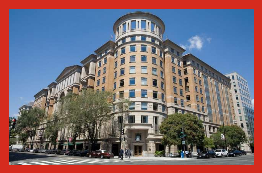
AARP National Office