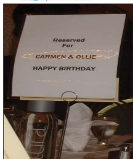
The Beasley group was prepared to party.