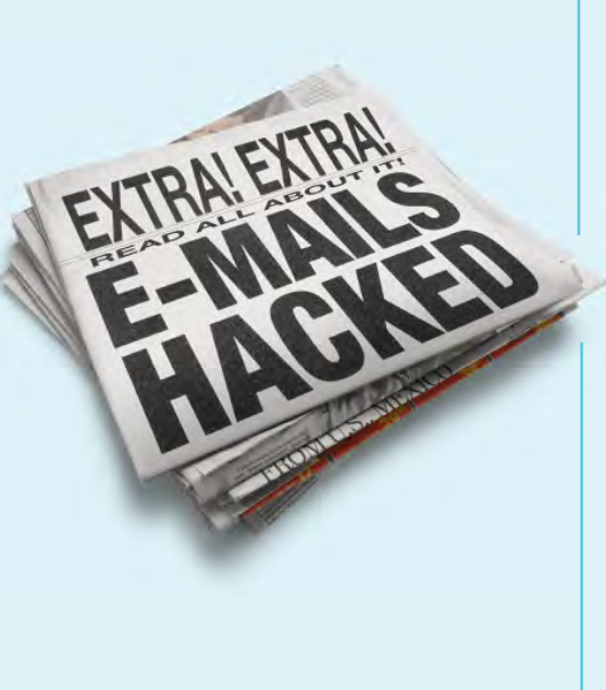
* If you have trouble finding the BCC: function try using the HELP feature or F1 and search BCC

When I got home the other evening I found a message on my answering machine that started out "I think my e-mail has been hacked." (Answering machines are much harder to hack than voice mail). It was one of RTAC's Directors who I will refer to as Anonymous Director (AD). The rest of the message explained that he was getting calls from people he knew asking him if an e-mail they received was really from him. The text of the e-mail was 'Click here and enter your information to receive an important document.'