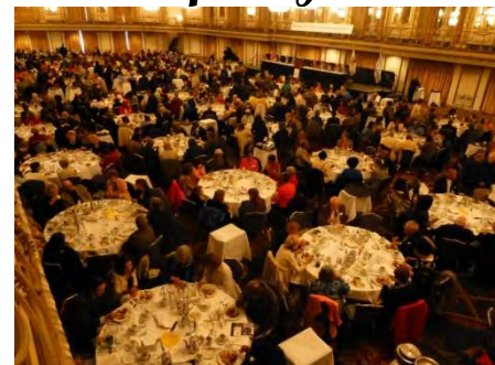
Food, Friends and Fun