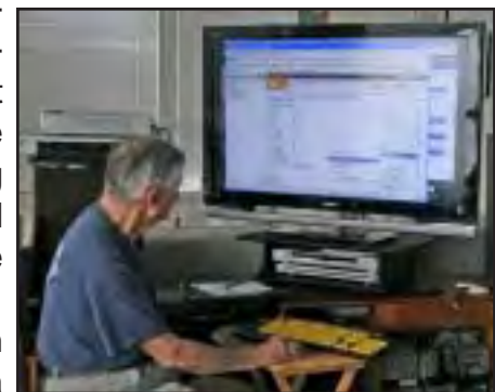
V.K. at his workstation

(We wish they used a healthier strain of mice, though; both our original