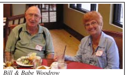
S.W. FLORIDA SATELLITE MEMBERS MET FOR THE FIRST TIME MARCH 2