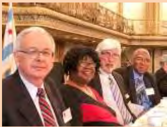
Head Table (left)