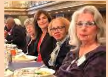
Head Table (Right)