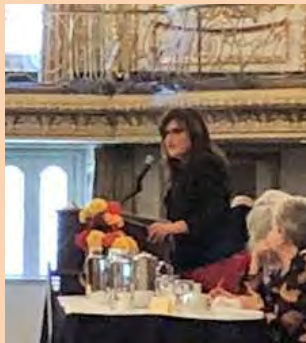
CTPF Executive Deputy Director presenting 2018 Health Insurance Highlights