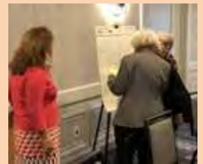
Posting the totals