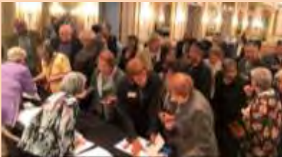
Collecting ballot 'boxes'