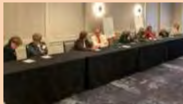
Talliers tallying the votes