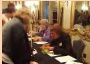
Waiting to pick up tickets and enter.