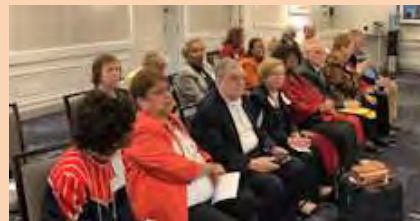
Watchers watching the tally